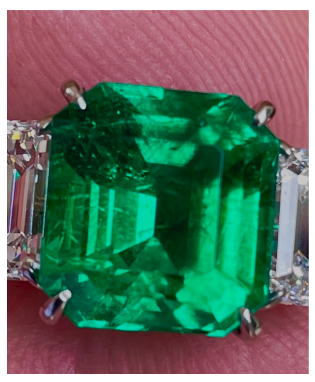
5.64 Colombian emerald, clarity enhanced