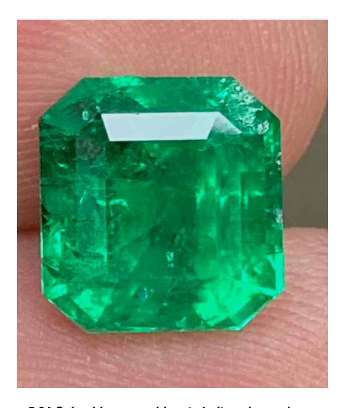
5.64 Colombian emerald, not clarity enhanced (post removal of filler)